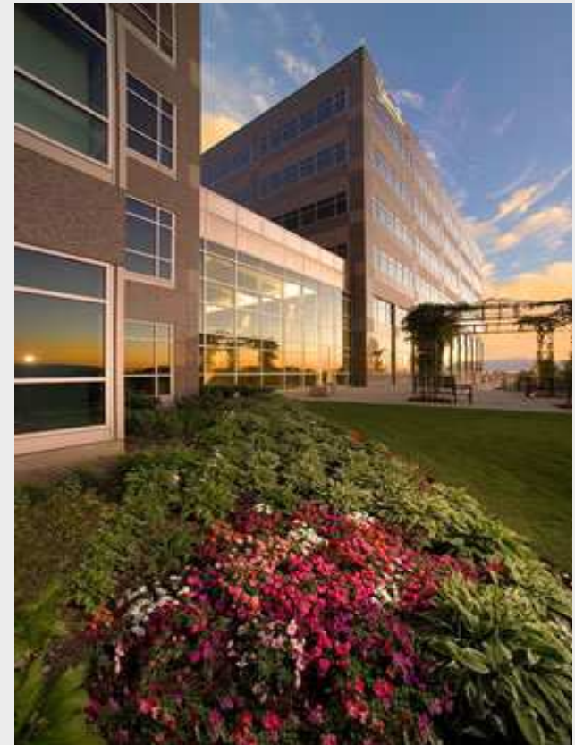
Cottonwood Corporate Center Salt Lake City, UT ENERGY STAR 2006-2009 BOMA TOBY Award 2009 Pursuing LEED Certification