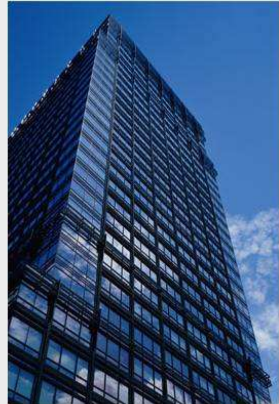
Hines 560 Mission San Francisco, CA ENERGY STAR Labeled