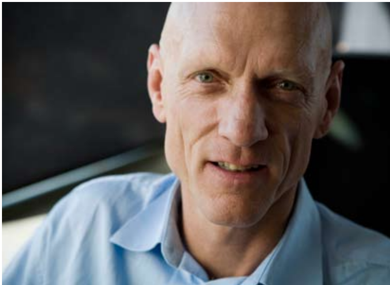
The Hon Peter Garrett, Australia's Minister for the Environment, Heritage and the Arts

In 2008 RIAA received funding from the Federal, Victorian and NSW environment departments, including EPA Victoria, to embark upon its most ambitious project to date - the Responsible Investment Academy Australasia.